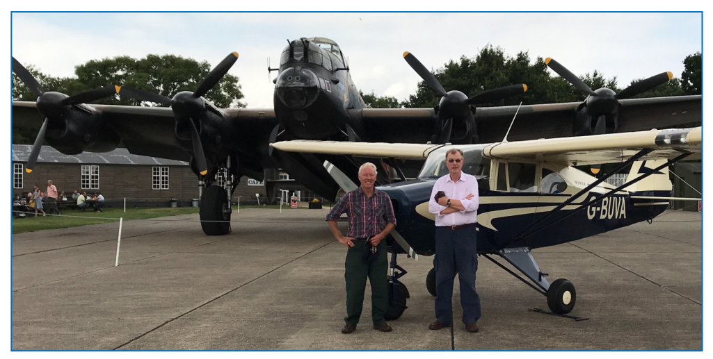
One for the album!