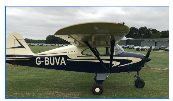
Old Warden and the Shuttleworth Collection

The highlights of the trip were East Kirkby and Old Warden, both places are a must to get there and take in the Air Museums. We were lucky to have BUVA photographed with "Just Jane", the Lancaster Bomber at East Kirkby as a backdrop, beat that!